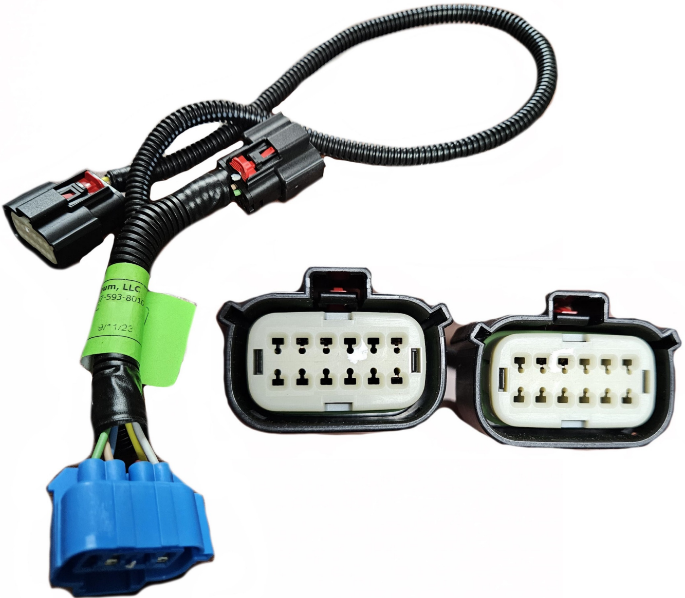
Two 12 pin Connectors