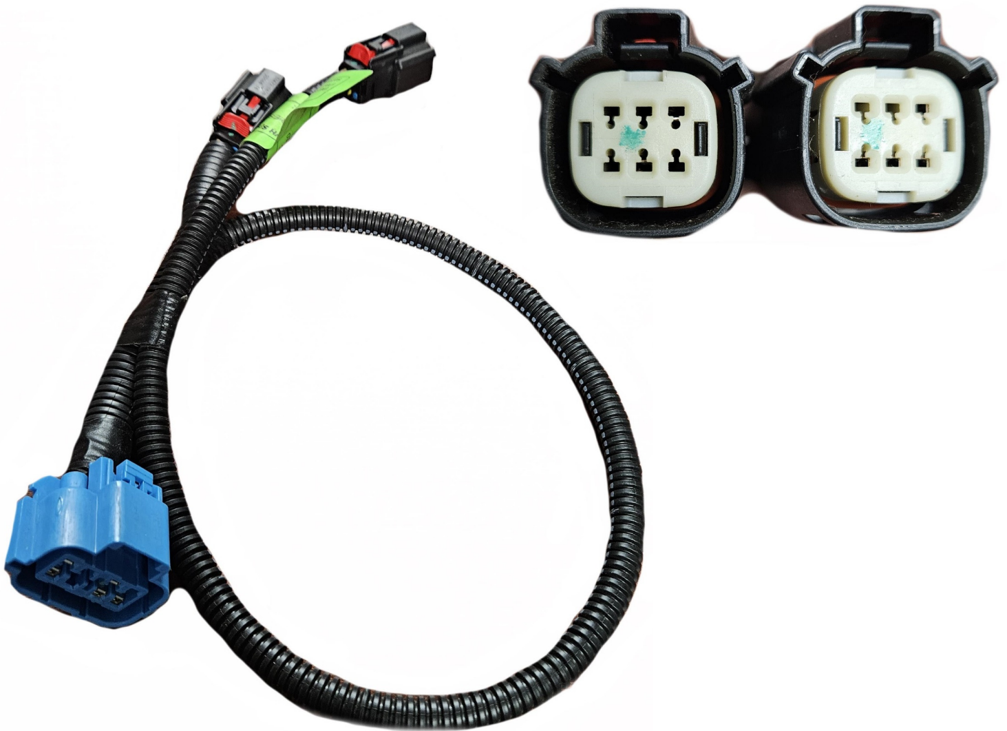
Two 6 pin Connectors