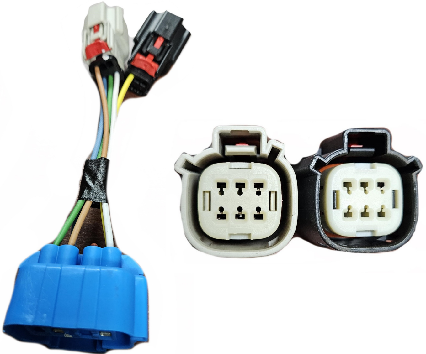
Two 6 pin Connectors