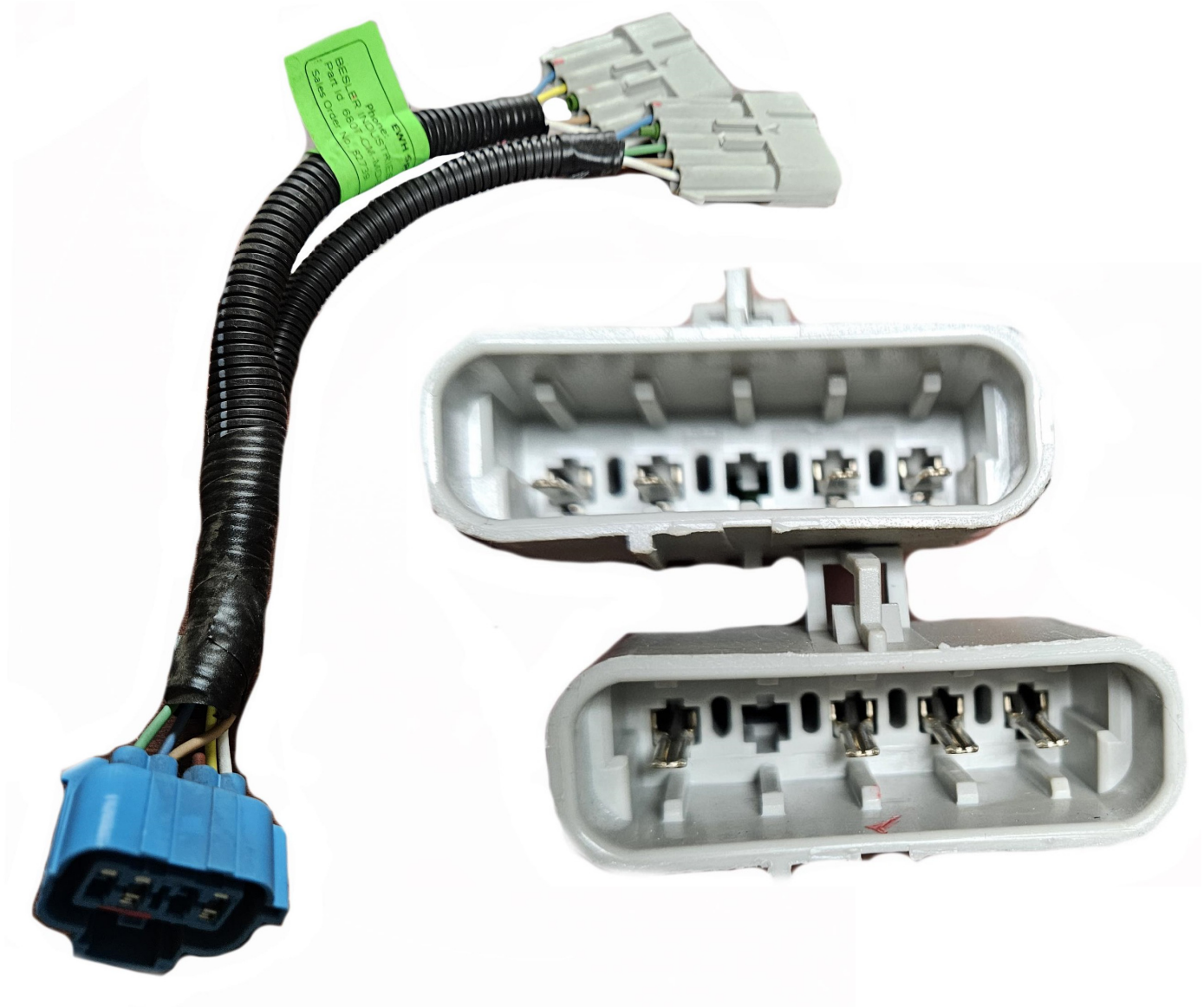
Two 5 pin Connectors

2019 & UP GM Truck 4500-6500 Cab & Chassis