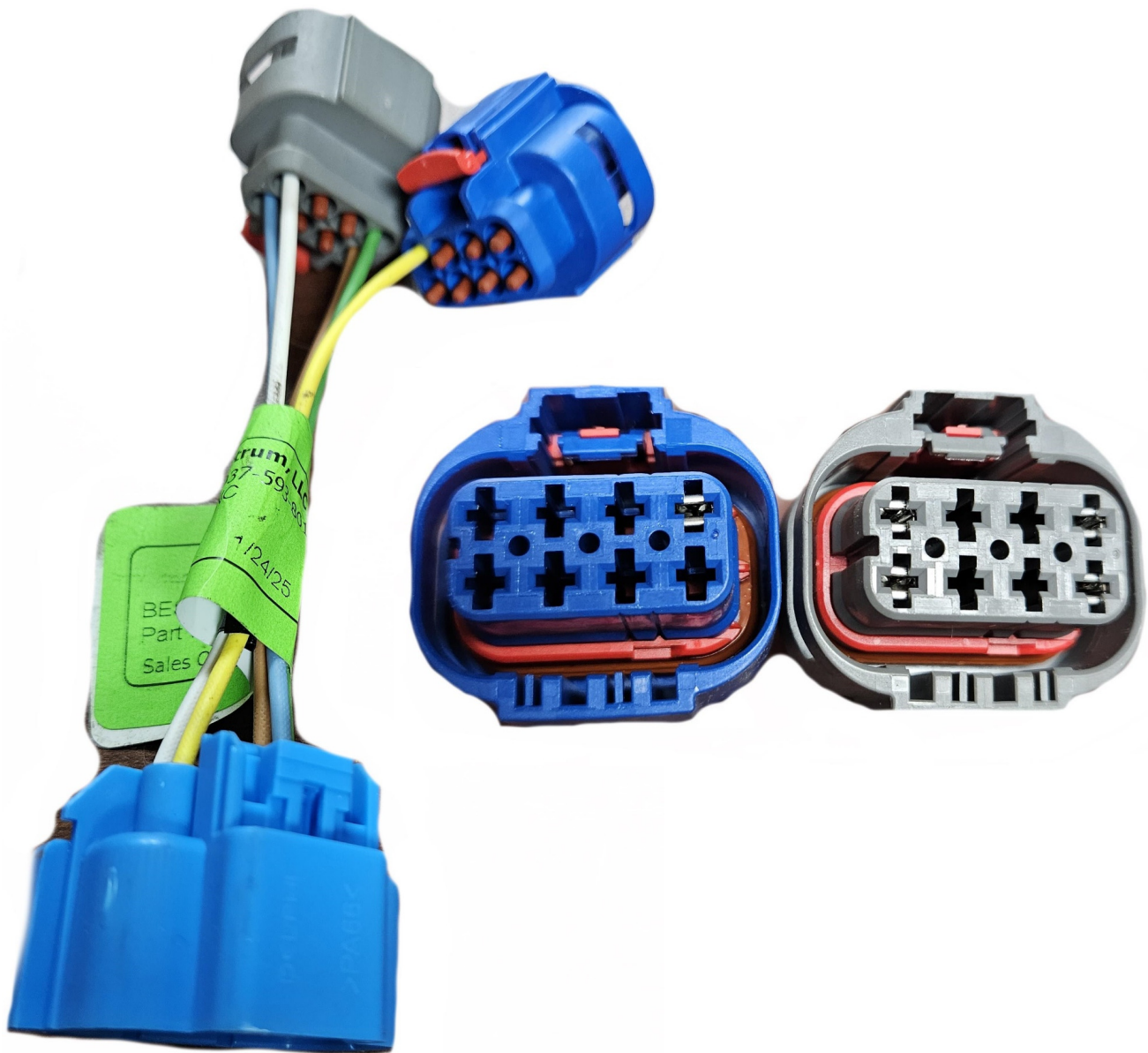
Two 8 pin Connectors