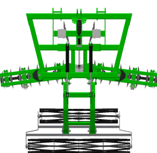
Least aggressive pitch 7 degrees 11' 8" wide Non folding wings