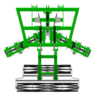
Most aggressive pitch 27 degrees 10' 8" wide Non folding wings