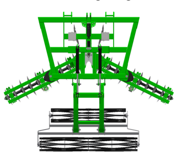
Most aggressive pitch 27 degrees 12' 8" wide Non folding wings