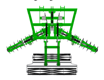
Most aggressive pitch 27 degrees 13' 5" wide Folding wings