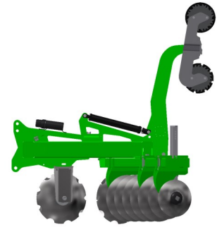
The double basket assembly folds up for storage purposes and easy transport.