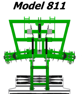
Least aggressive pitch 7 degrees 8' 11" wide Non folding wings