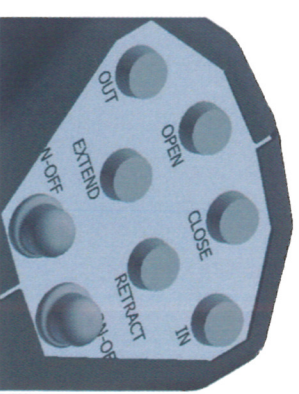
Pistol Grip 2