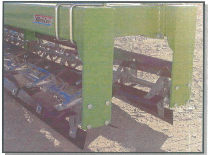
Model 9000 Double Tool Bar Five Spiral Blades on Front and Back