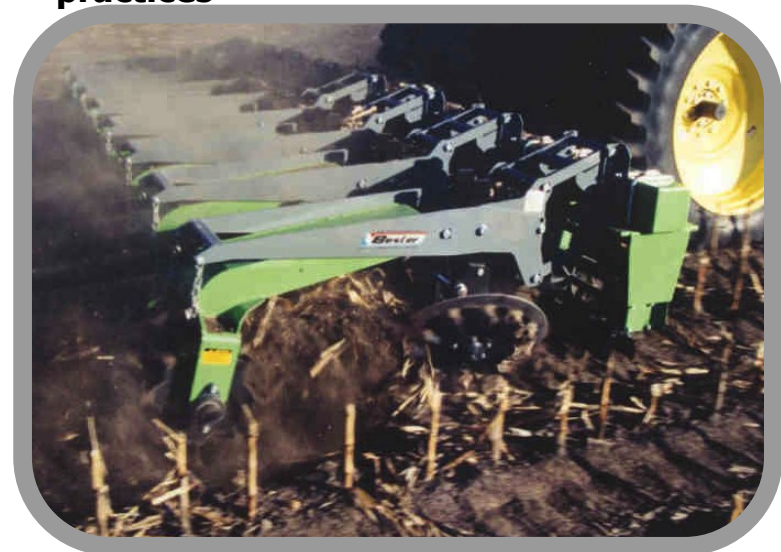
Regular Basket Assembly